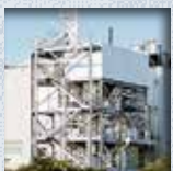
Combustion plants for the disposal of exhaust air, waste gases and liquid media