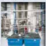
Ammonia recovery processes