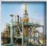
Turn-key units for waste gas scrubbing