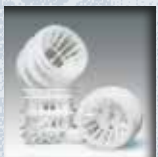
Biological carrier media